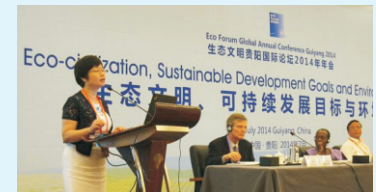
Academic leaders participated in Guiyang International Forum On Ecological Civilization in 2014 annual meeting