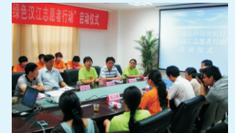
Hubei Environmental Protection Propaganda

(6) International Communication and Cooperation