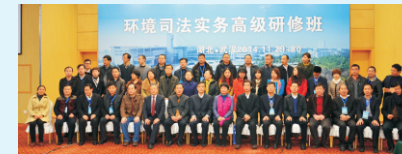
Held High-class Seminar on the national Environmental Judicial Practice in Wuhan