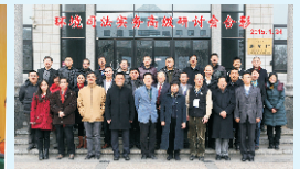
Held High-class Seminar on the national Environmental Judicial Practice in Beijing