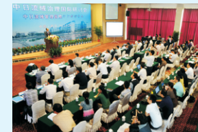
The International Symposium on Watershed Governance between China and Japan

(6) International Communication and Cooperation